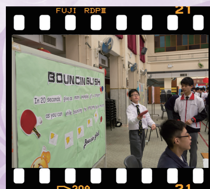
The Bouncinglish Booth