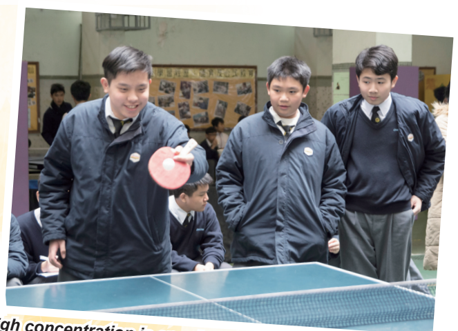
High concentration is an advantage to win the game