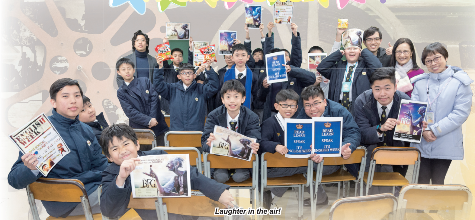
Laughter in the air!

To wrap up the eventful English week, the movie show was held in as its finale. Students and teachers watched The Big Friendly Giant (BFG) at our very own makeshift theater. The cinematic quality is nothing to brag about but that isn't enough to stop a good story from working its magic. With free snacks and drinks and a good show, our students thoroughly enjoyed their time.