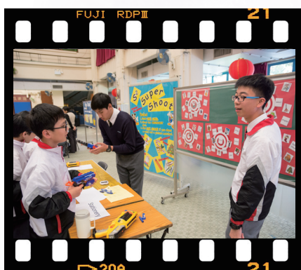
EA giving instructions

Tongue Twister was welcomed by students who wanted to put their English fluency to the test. While Matching was an interesting game for those who could quickly match the pictures with their corresponding names. It's not uncommon to see students helping each other in the course of the game and this has shown they were all enjoying the process and not only the prizes.