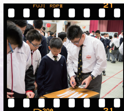
The good old Tongue Twister

Students had a good time playing games, getting prizes while learning English.