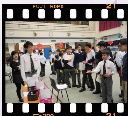
Ready, Steady, Toss!