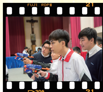
Getting competitive at Super Shoot

Super Shoot seemed to be the most popular game as students had a chance to shoot objects representing the answers. Shooting accurately was challenging for some students who failed to shoot the objects despite knowing the answers. But this challenge actually has added more fun to the game.