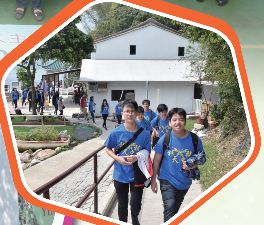
Here we go!