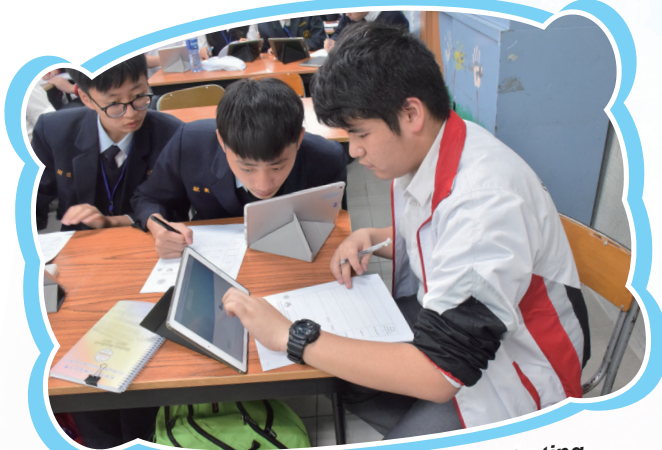
Choi Hung boys are demonstrating the use of iPad in learning