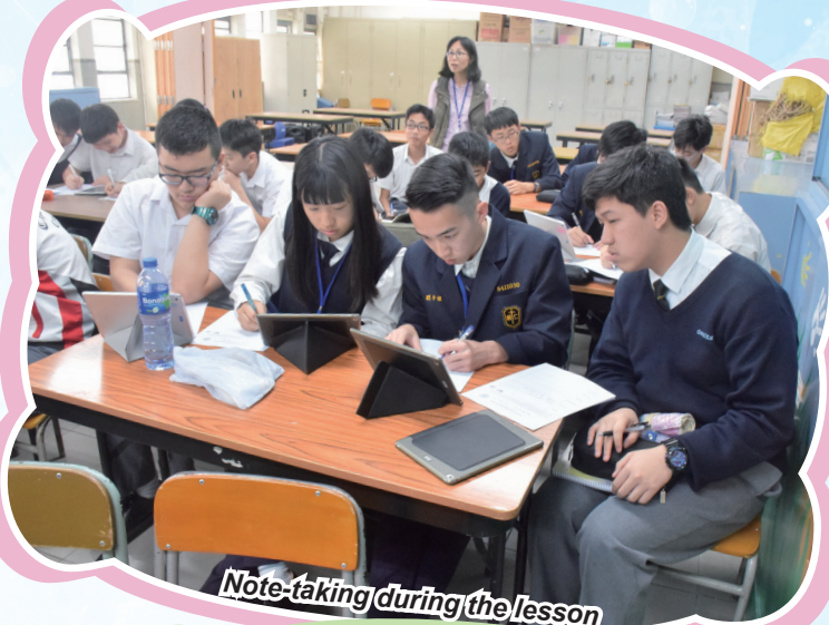
Note-taking during the lesson

The topic of this lesson was charities in Hong Kong. Students were able to exchange ideas on how charitable work can improve the quality of lives of many people. Some students even showed interest in working as volunteers in the near future when they realized the benefits of giving.