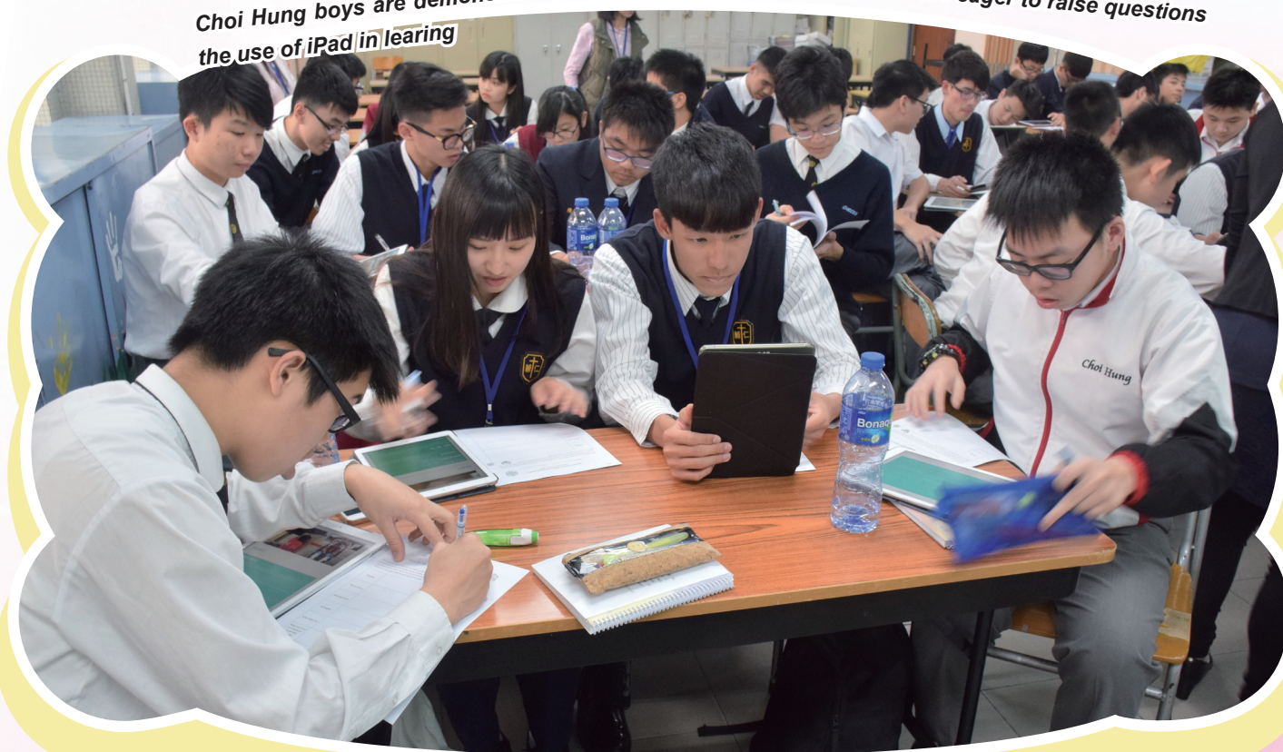
Collaborative learning with Fu Jen students