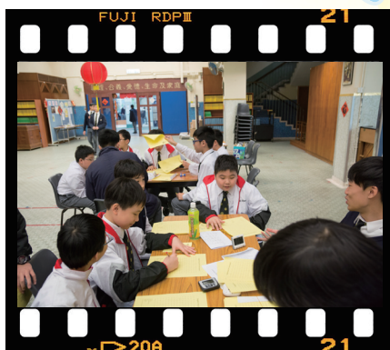
Every second counts