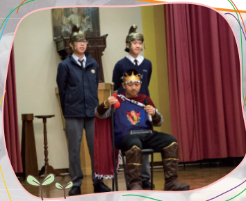
The bossy king