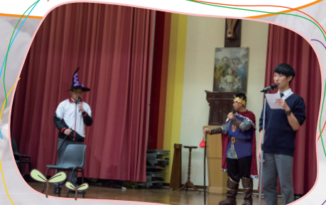
The wizard bargaining with the king