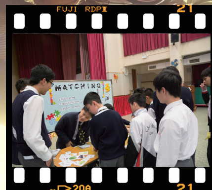
It's matching time!