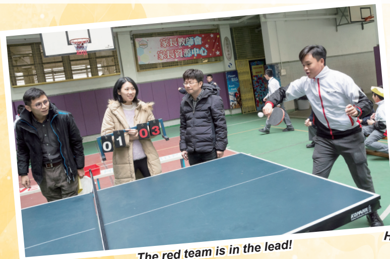
The red team is in the lead!

Amongst many of the English activities held during English week, students like Table-Tenglish the most. What is that? It's a simple game. Students had to play table tennis but at the same time think of different vocabulary under the themes given by the English teachers. Not only because it is fun-filled and enjoyable, but also because students can learn English in a fun way outside the classroom. It has long been our tradition to hold Table Tenglish for junior form students. It is a game that requires high concentration and skills, but who doesn't like challenges?