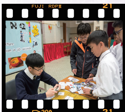
EA host timing challengers