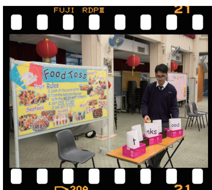
Getting ready for another round

Six game booths were set up in the hall encouraging English learning in a relaxing and fun environment. The booths offered games ranging from more physically active ones namely Bouncinglish, Food Toss, and Super Shoot, to relatively physically less demanding ones namely Tongue Twisters, Word Search, and Matching. All booths were run by English Ambassadors (EA).