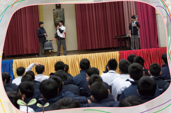
The audience watching attentively

Students were given a chance to showcase their learning outcomes and learn from their peers in the event. It was also a valuable experience for them to perform on stage. Most importantly, the event helped spread God's message to many more people.