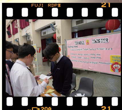
The Tongue Twister Booth