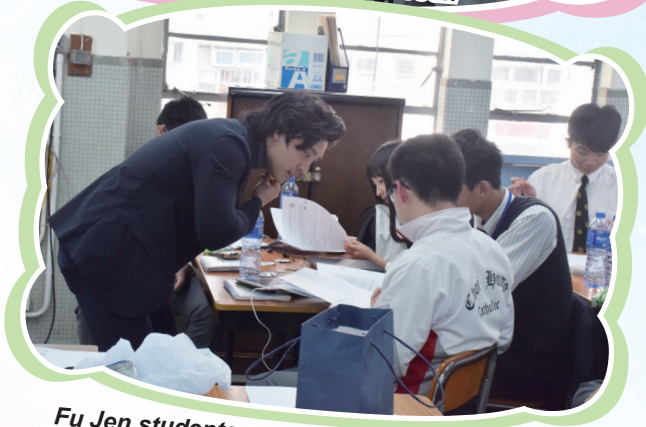
Fu Jen students are eager to raise questions