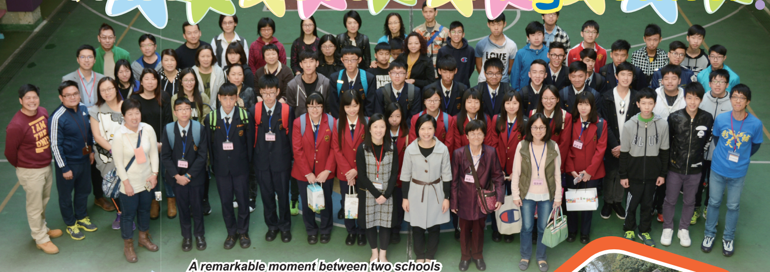
A remarkable moment between two schools