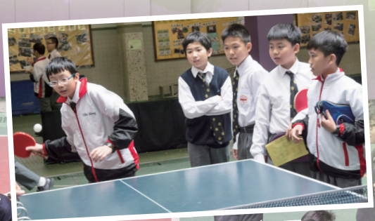
Watch out ! It's a fast ball!