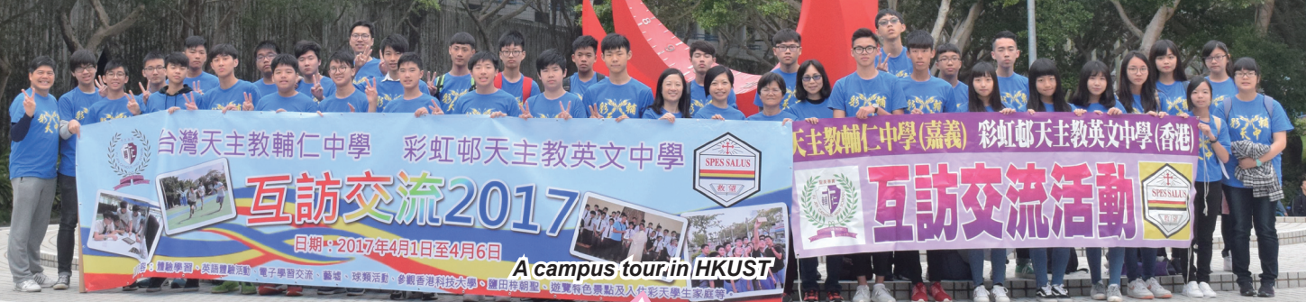
A campus tour in HKUST