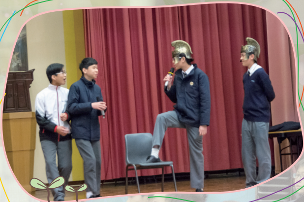
The chair belongs to me! Not you!

A group of students from different forms joined the English Evangelization drama this year. They have performed in many primary schools in Wong Tai Sin district. The play is called "Happy are the poor, the kingdom of God is yours" . This story is about a chair that everyone wants, including a bossy king, two wicked merchants and some robbers. At last, only a poor man and his son were able to own the chair because they cherish it wholeheartedly. We showed this drama during English week and students liked it very much.